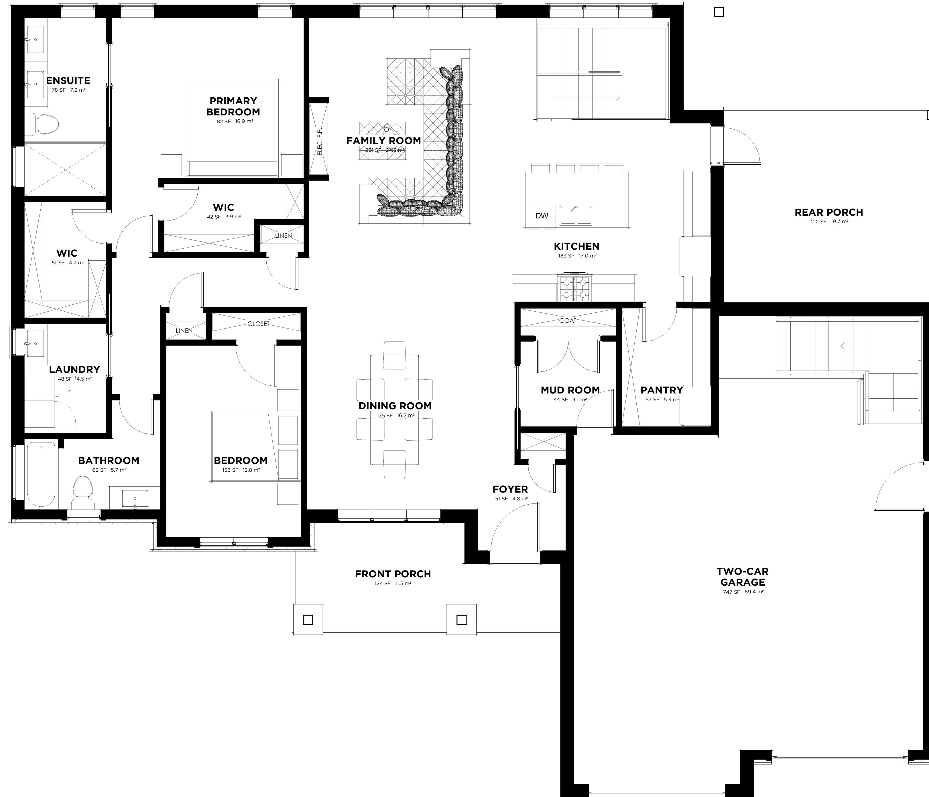
1 Main Floor Plan 1/4" = 1'-0"